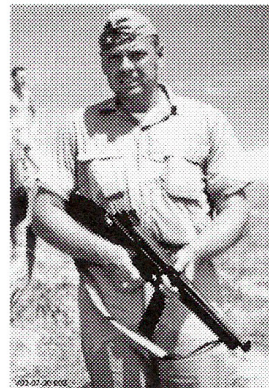
Captain, United States Naval Reserve 1944 - 1986 World War II, Korea, Vietnam