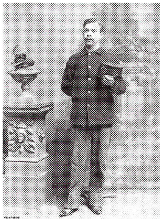
Private, United States Army Spanish American War