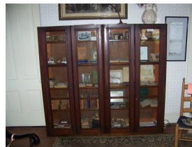
The Lincoln Bookcase