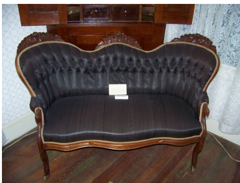
Antique horsehair loveseat