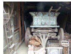
Period wagon in shed