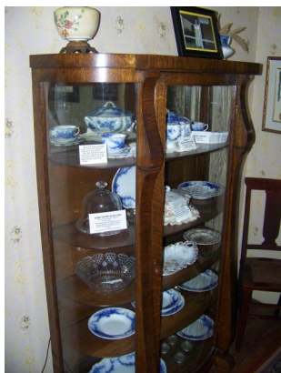
China cabinet in dining room