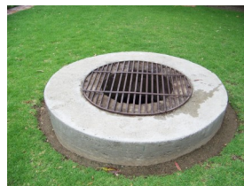
Cistern in back yard