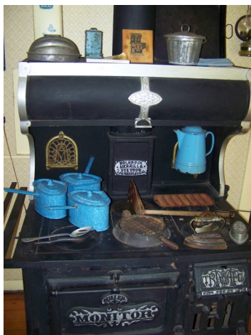
Woodfire stove with antique furnishings